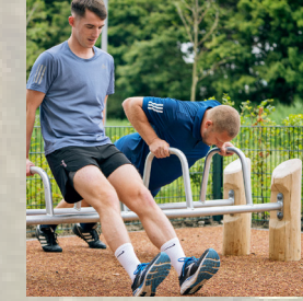
Adult trim trail