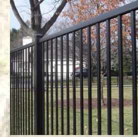
New railing panels