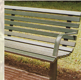
Traditional seats with armrests