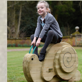
Small play features