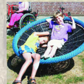
Inclusive play items