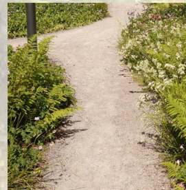
Compacted gravel paths