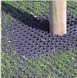
Porous grass matting