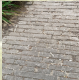
Small paving units to define entrances