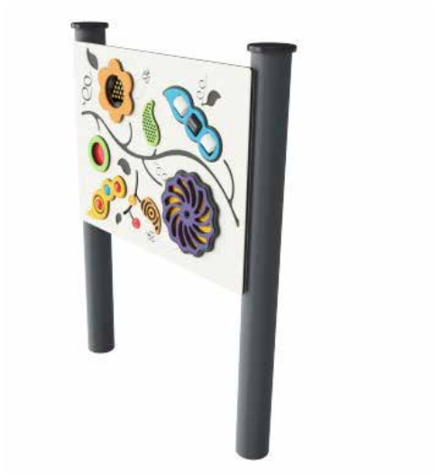
4 Proposed Play Equipment - Sensory Multi Play Panel