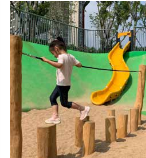
12 Existing Play Equipment - Balance Posts with Rope