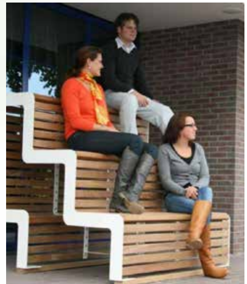
22 Proposed Furniture - Stair Benches - Bespoke