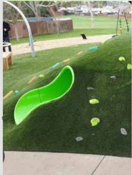
15 Proposed Play - Bespoke Tunnel Through Mound with climbing grips