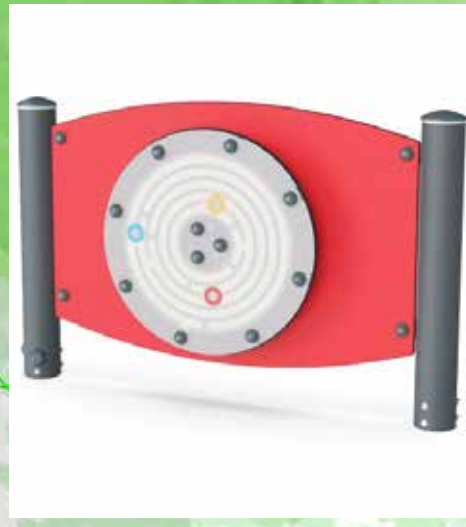
5 Proposed Play Equipment - Play Panel 1 - Maze