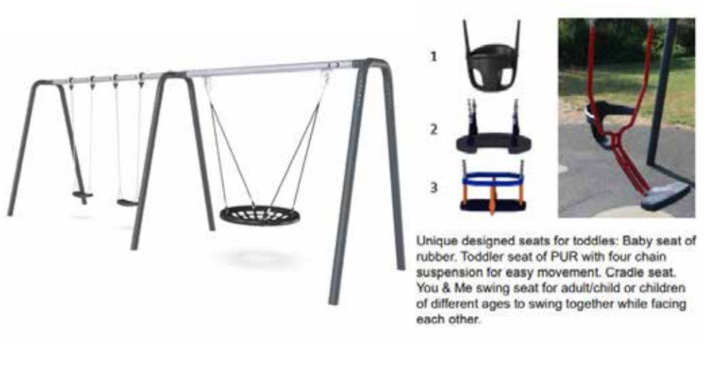
7 Proposed Play Equipment - Steel Swing H:2.5m, 100cm Rope Seat, Anti-wrap