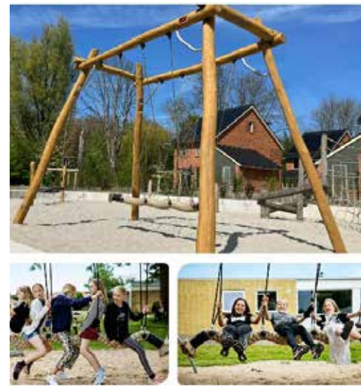
19 Proposed Play Equipment - CocoWave Pendulum Swing on the sand base