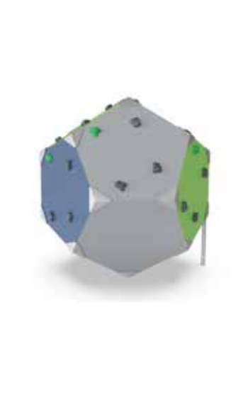
20 Proposed Play Equipment - Climbing Structure - BLOXX 1