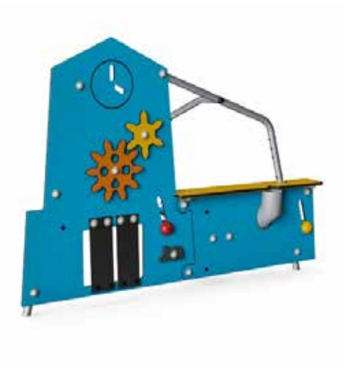
8 Proposed Play - Toddler Equipment -Creative Workshop