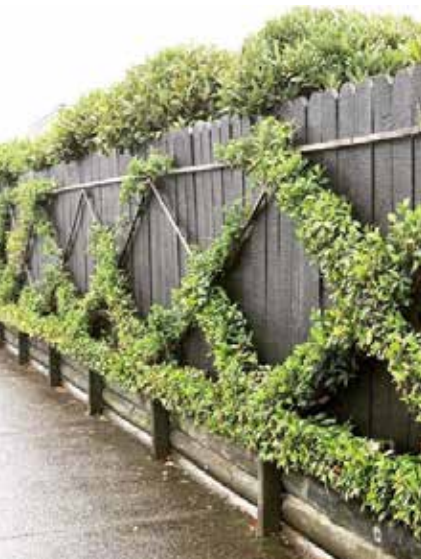
24 Proposed Green Buffer - Climbers Planting on Trellis