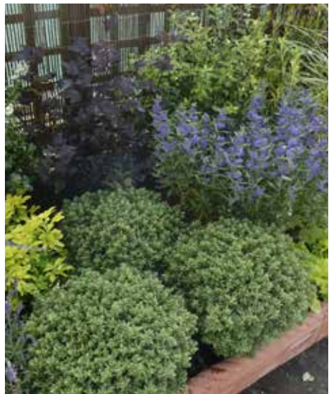
23 Proposed Green Buffer - Shrub Mix