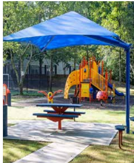
25 Proposed Shade - Cantilever Umbrella - Vary Size