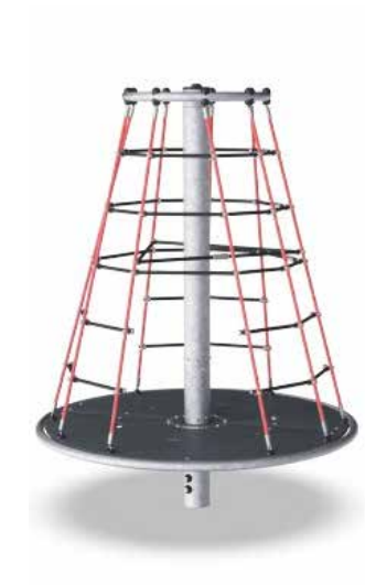
18 Proposed Play - Inclusive Twister