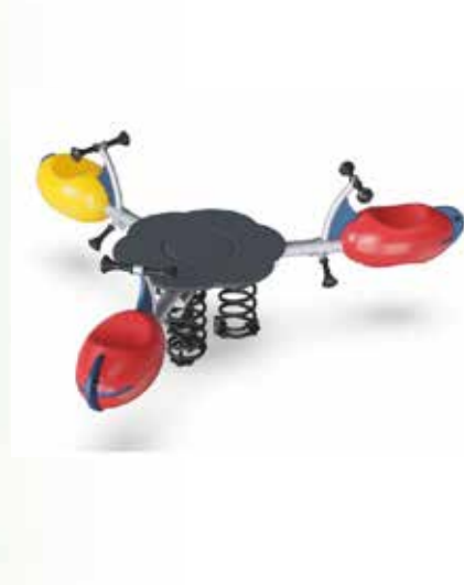
10 Proposed Play Equipment - Blazer