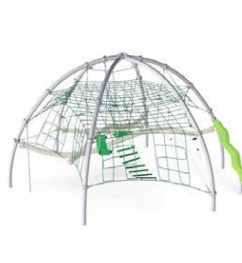
13 Proposed Play Equipment - Explorer Dome