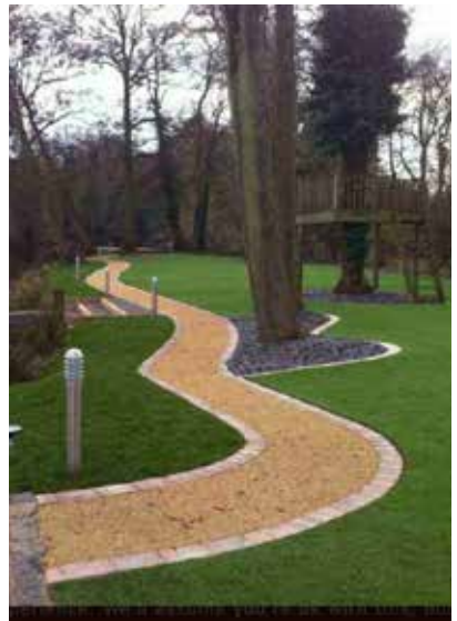
26 Proposed New Path- Permeable Resin Bound Gravel