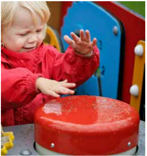
3 Proposed Play Equipment - Play Panel High 2 - Music