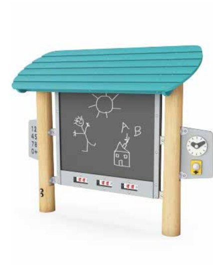
11 Proposed Play Equipment - Play & Learn Blackboard