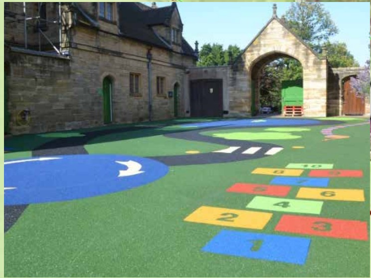
27 Proposed Play Equipment - New Porous Wetpour Rubber Granules Playground Safety Surface