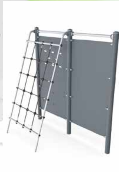
21 Proposed Play Equipment - Vertical Net / Wall