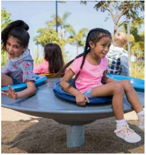
2 Proposed Play Equipment - Multispinner Carousel, Teal