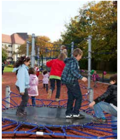
17 Proposed Play Equipment - Hexagonal Jumping Net