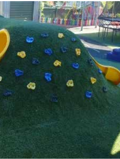
18 Proposed Play Equipment -Bespoke Play Mound with climbing grips