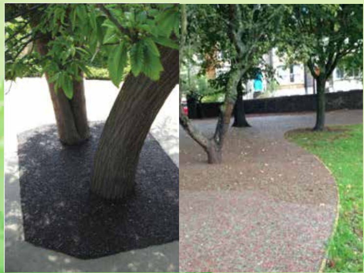
28 Proposed Tree Pit / Surfacing Close to Tree - New Porous Rubber Mulch