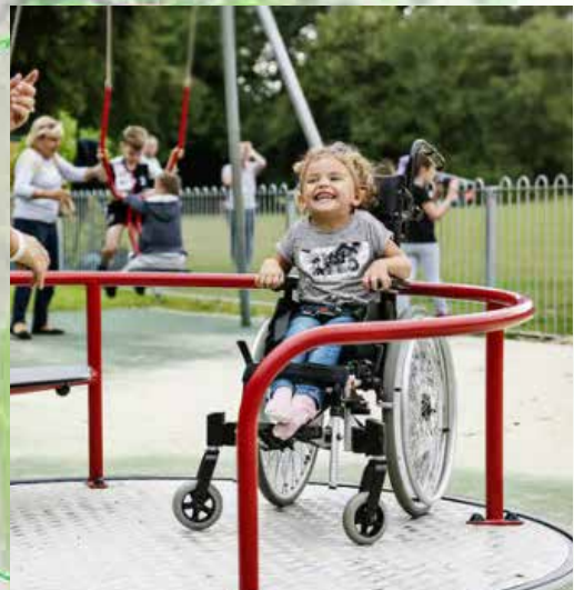
9 Proposed Play Equipment - Wheelchair Carousel