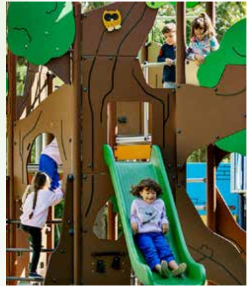
16 Proposed Play Equipment - Hangout Tree with Hideaway