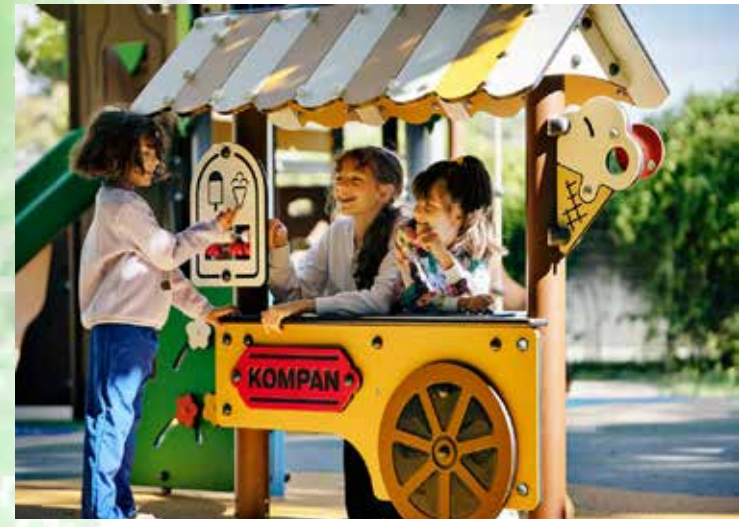
6 Proposed Play Equipment - Ice Cream Cart