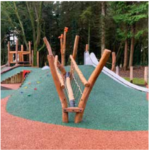
1 Proposed Play Equipment - Bespoke Timber bridge on the play mound