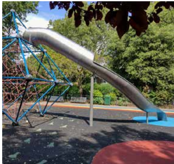
2 Existing Play Equipment - Climbing Frame and Slide to be retained and refurbished