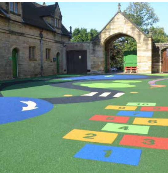
21 Proposed Play Equipment - New Porous Wetpour Rubber Granules Playground Safety Surface