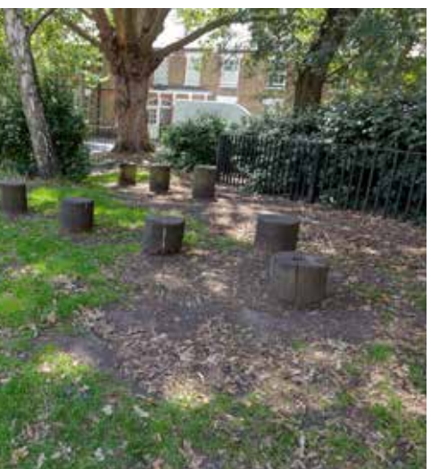
15 Existing Play Equipment - Timber Posts to be retained and refurbished/replaced/relocated