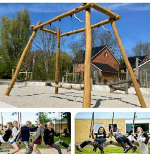
16 Proposed Play Equipment - CocoWave Pendulum Swing on the sand base