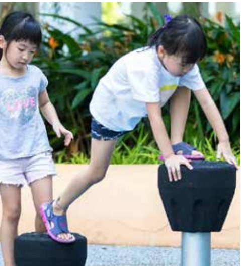
10 Proposed Play Equipment - Balancing & Climbing - Stepping Pod