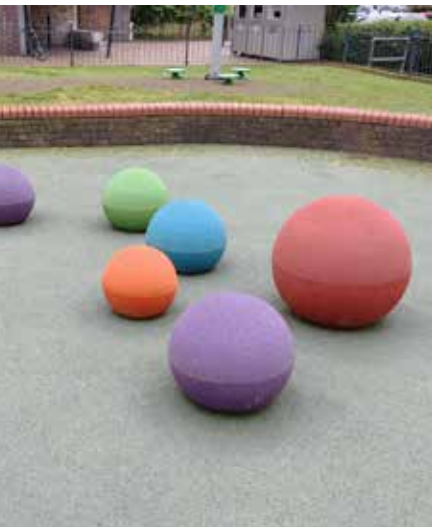
11 Proposed Play Equipment - Interactive Spheres