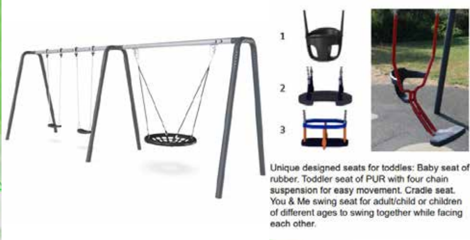
4 Proposed Play Equipment - Steel Swing H:2.5m, 100cm Rope Seat, Anti-wrap