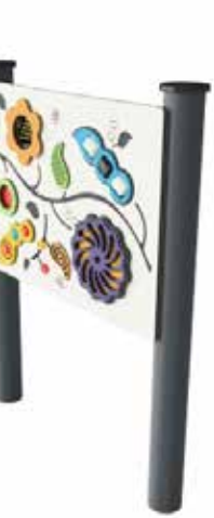
6 Proposed Play Equipment - Sensory Multi Play Panel