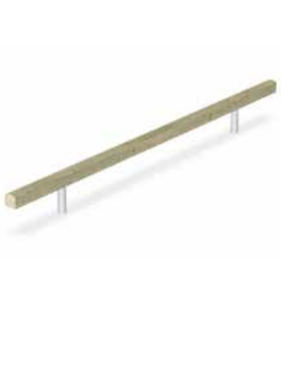
13 Proposed Play Equipment - Balance Beam