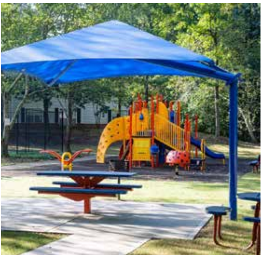
18 Proposed Shade - Cantilever Umbrella - Vary Size