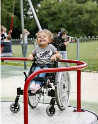
8 Proposed Play Equipment - Wheelchair Carousel