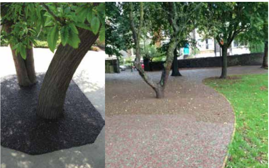
22 Proposed Tree Pit / Surfacing Close to Tree - New Porous Rubber Mulch