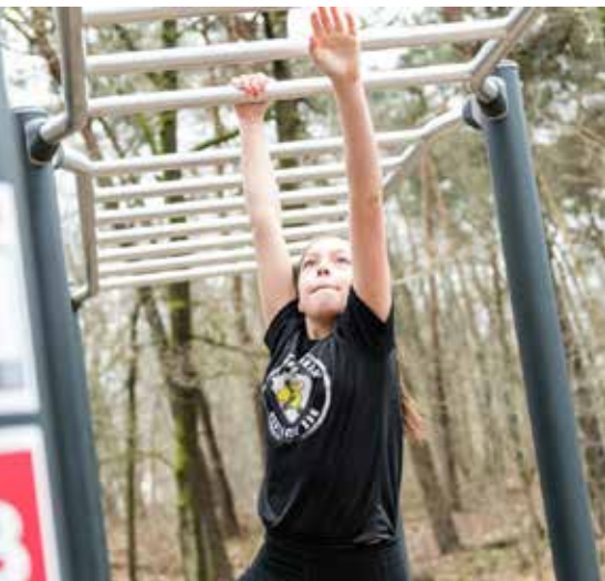
17 Proposed Play Equipment - Overhead Ladder