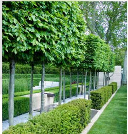
19 Proposed Green Buffer - Hedge/Shrub Mix