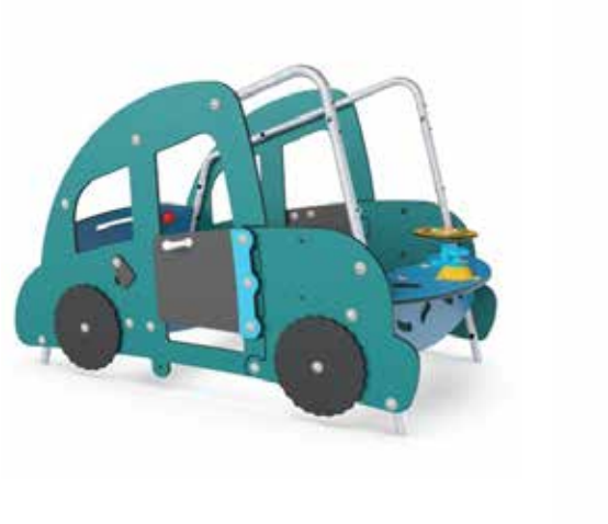
5 Proposed Play Equipment - Double Car