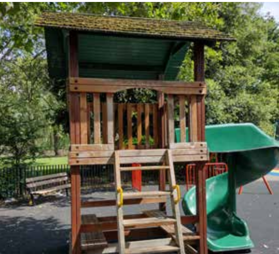
1 Existing Play Equipment - Climbing Frame and Slide to be retained and refurbished