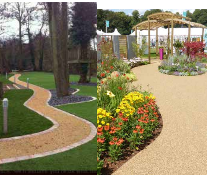
20 Proposed New Path - Permeable Resin Bound Gravel