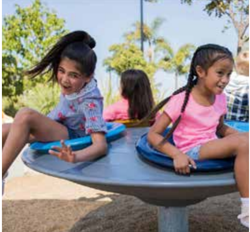
7 Proposed Play Equipment - Multispinner Carousel, Teal