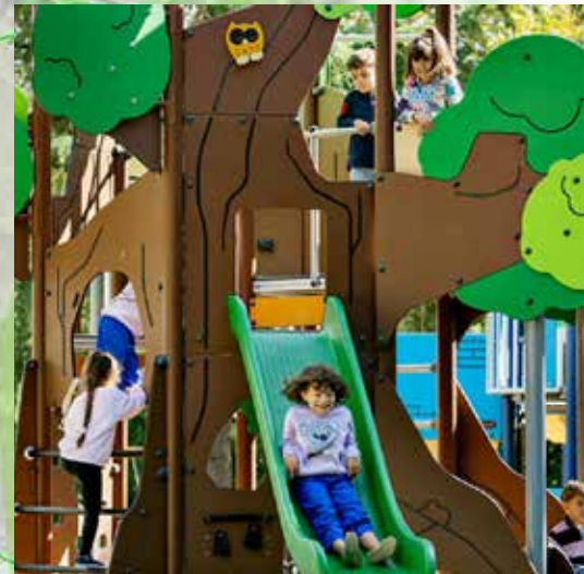
9 Proposed Play Equipment - Hangout Tree with Hideaway