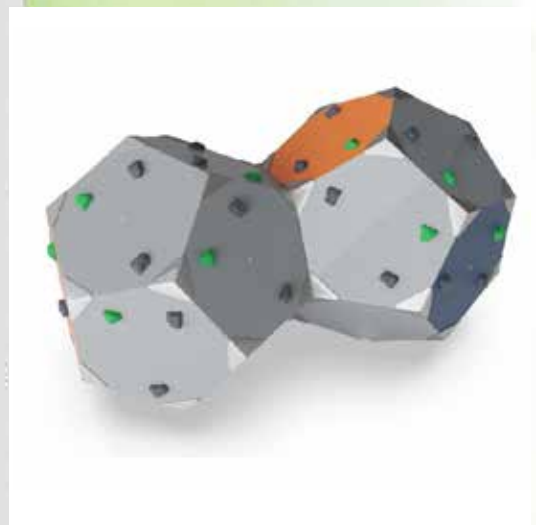
14 Proposed Play Equipment - Climbing Structure - BLOQX 2