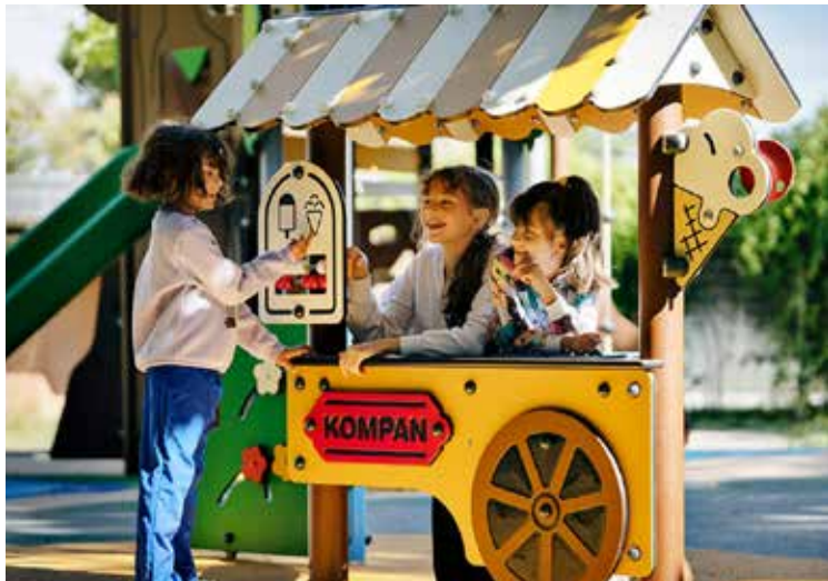
3 Proposed Play Equipment - Ice Cream Cart