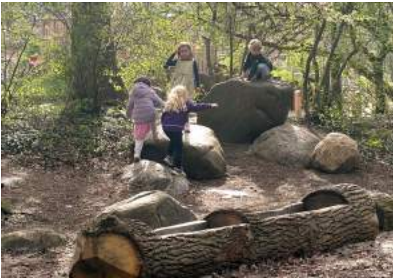
Nature playground in Valbyparken by Helle Nebelong