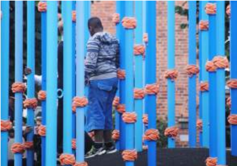
Guldbergs Plads by 1:1 landskab