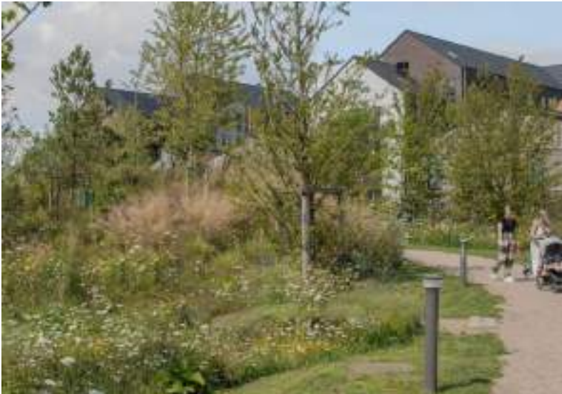
Søndervold Nature Park by SLA