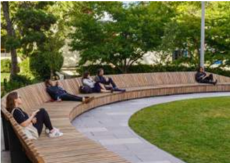
Bench by Streetlife

The photographs show reference projects to give you a feeling of the form, features and materials that could be found in this scenario.