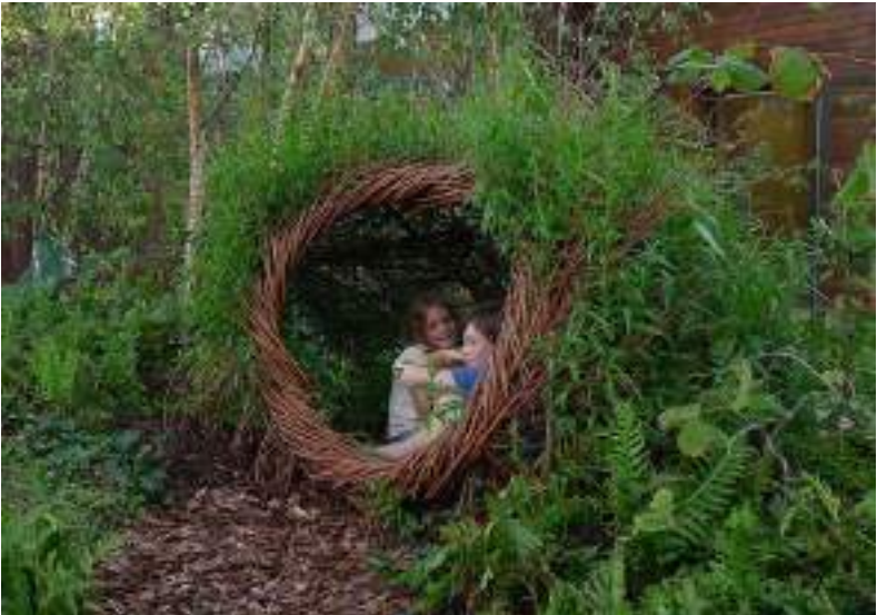
Tumbling Bay Playground by LUC