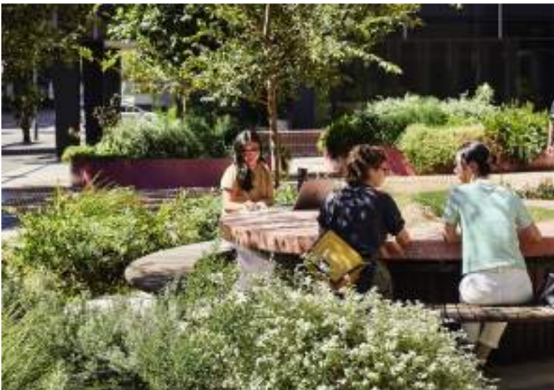
One Darling Island by ASPECT Studios