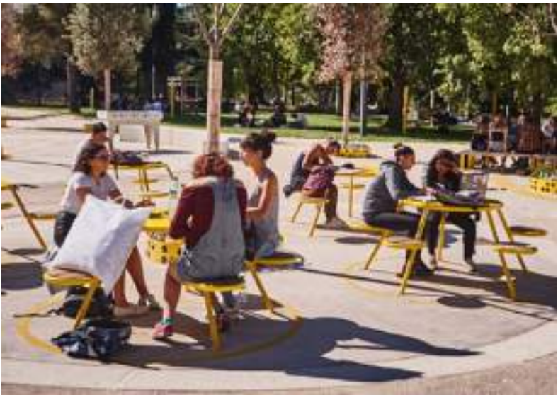
Picnic tables by Vestre