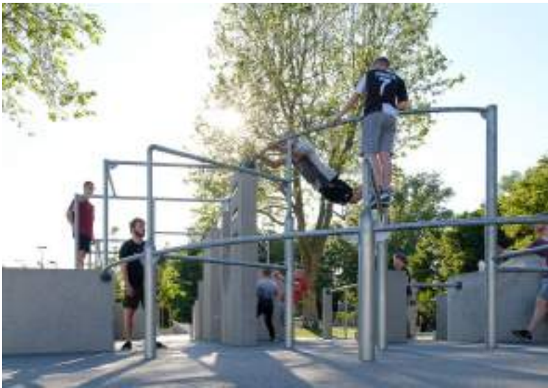
Rather Korso by DTP