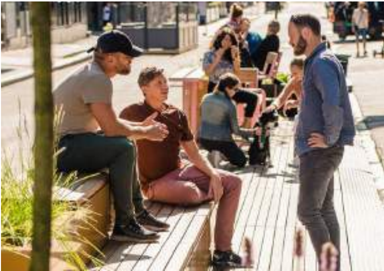
Parklets by SOLA