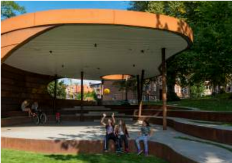
Mariaparken by Bascon/Metopos and Ravn Arkitektur