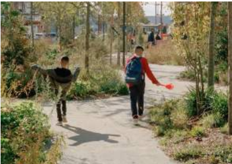
Gilly by CENTRAL + Plant & Houtgoed