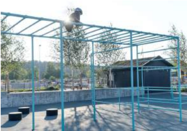
Anna Petrus Park by Karavan landskapsarkitekter