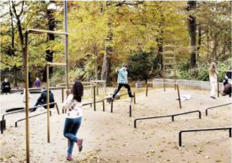
Naturpark Amager by LYTT Architecture