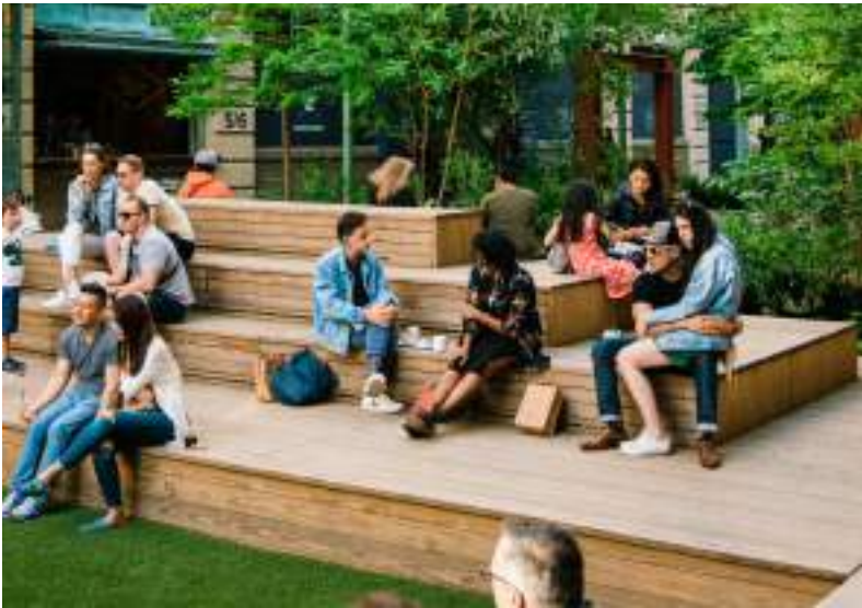
Industry City Courtyard by terrain-nyc