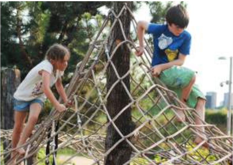
Tumbling Bay Playground by LUC