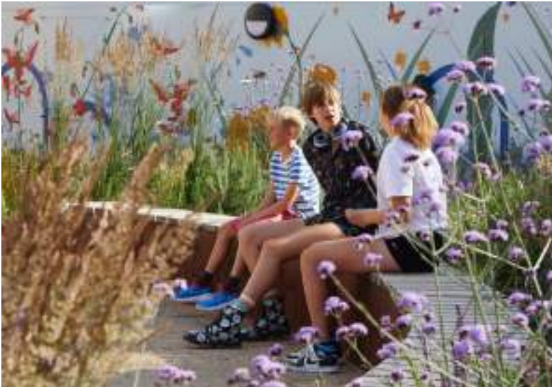
Glassfields by BJD landscape architects