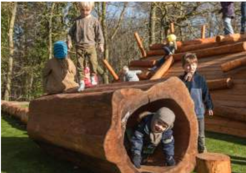
Tree Trunk Funk by MBYland