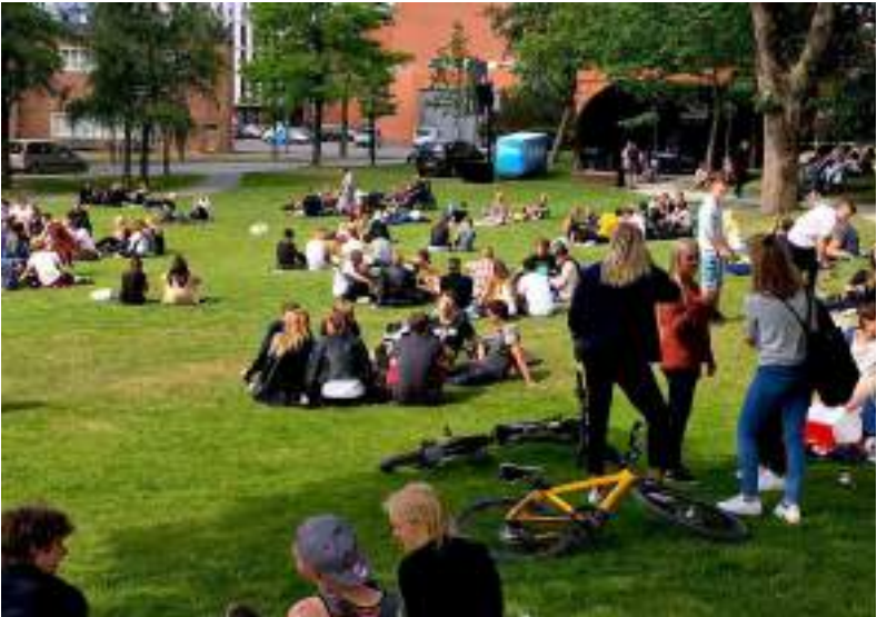
Mariaparken by Bascon/Metopos and Ravn Arkitektur