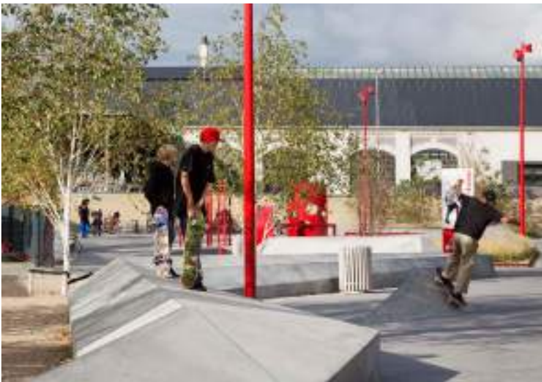
Plaza at Bavnehøj Arena by Opland Landskabsarkitekter