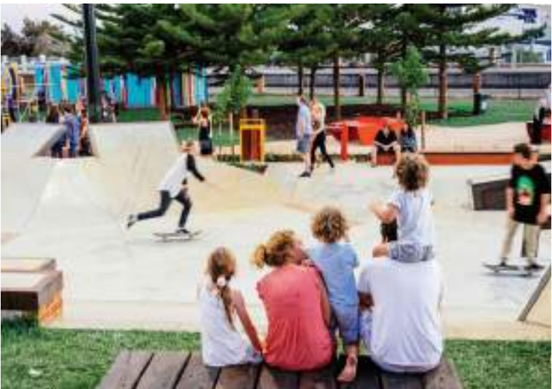
Fremantle Esplanade Youth Plaza by Convic