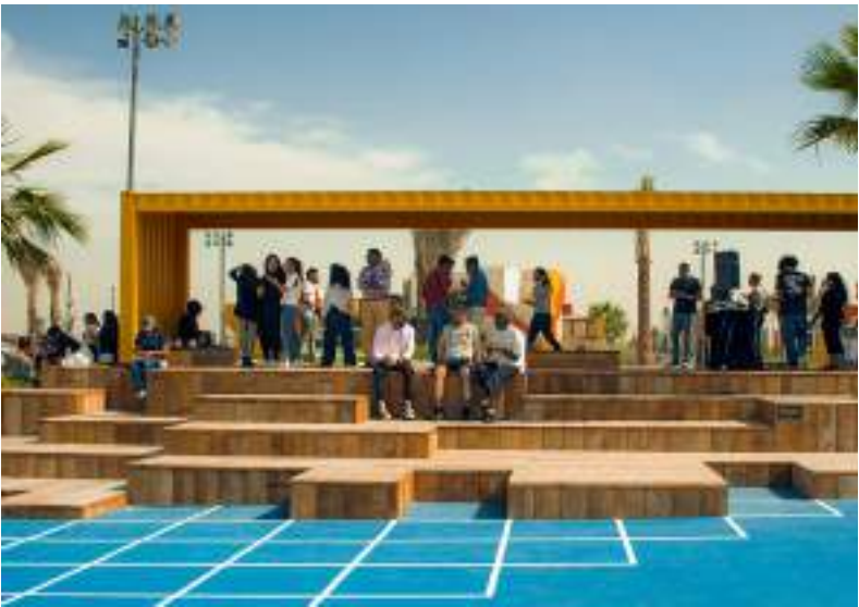
The Block by desert INK