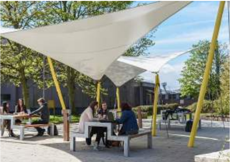
Outdoor seating at Loughborough University