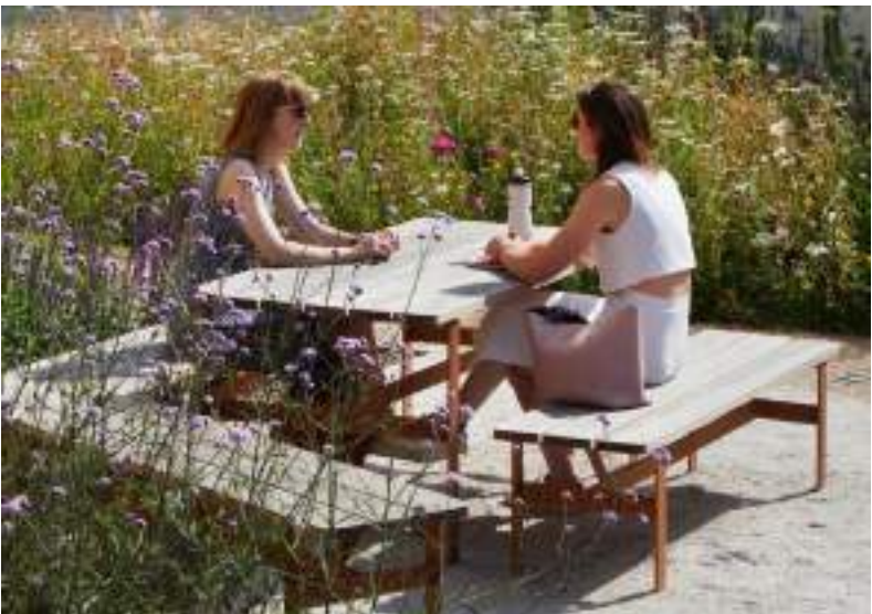
Glassfields by BJD landscape architects