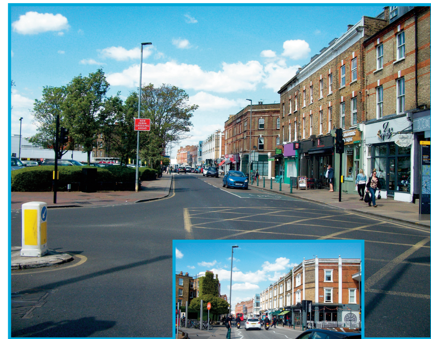
Funding has been approved to improve the public highway in Bedford Hill Between Balham Station Road and Balham High Road. What are your views?