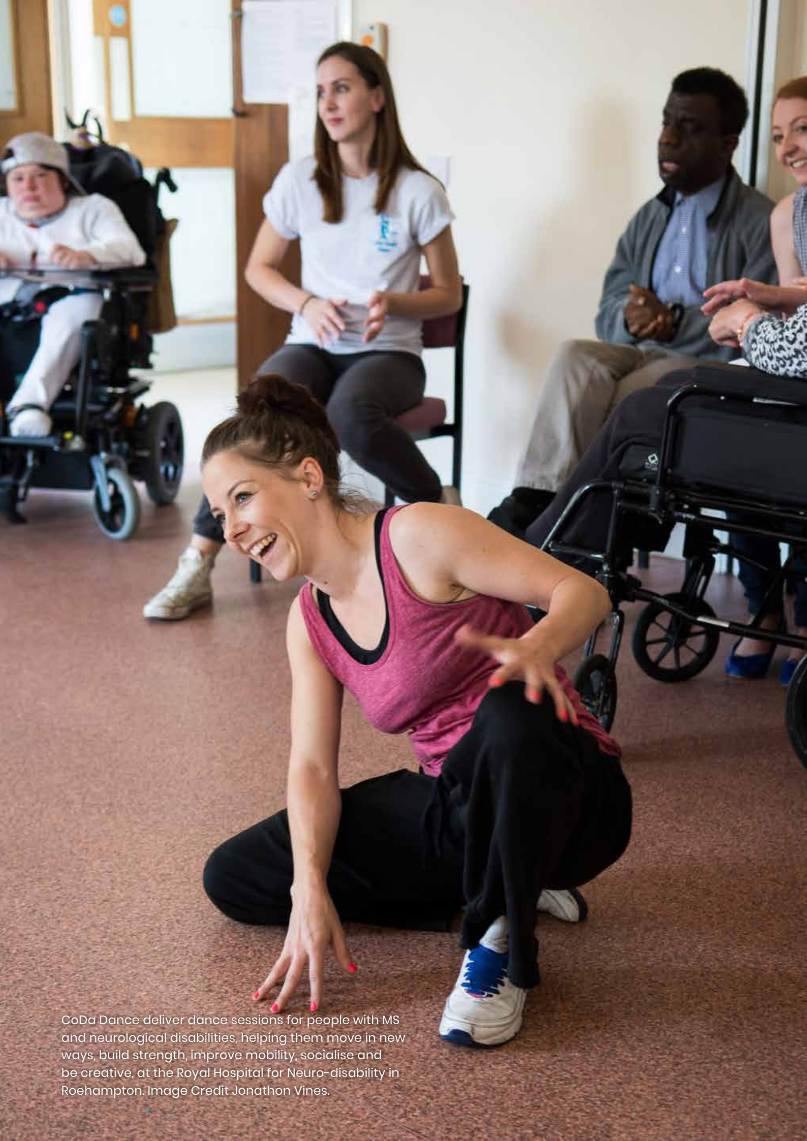
CoDa Dance deliver dance sessions for people with MS and neurological disabilities, helping them move in new ways, build strength, improve mobility, socialise and be creative, at the Royal Hospital for Neuro-disability in Roehampton.