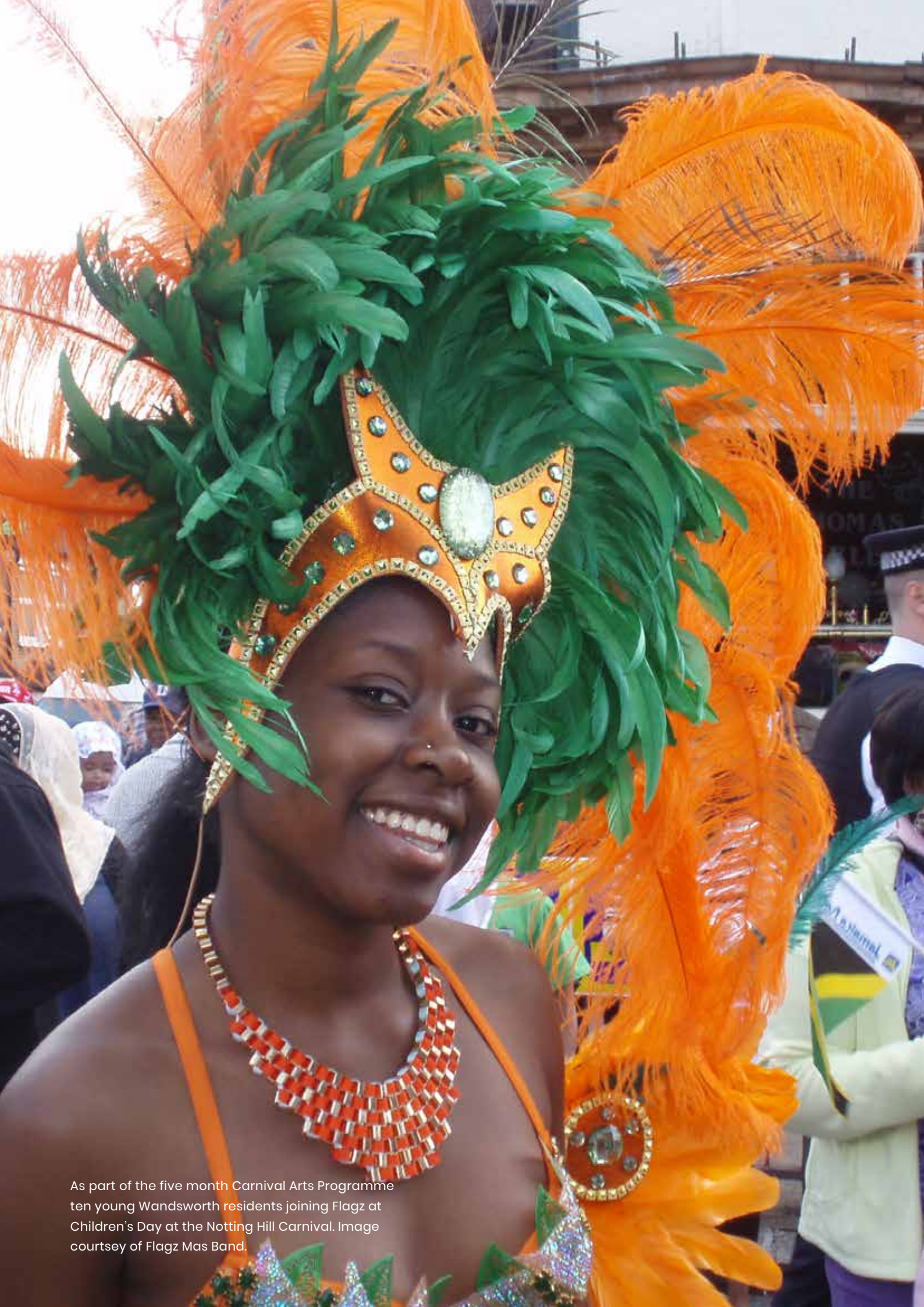
As part of the five month Carnival Arts Programme ten young Wandsworth residents joining Flagz at Children's Day at the Notting Hill Carnival.