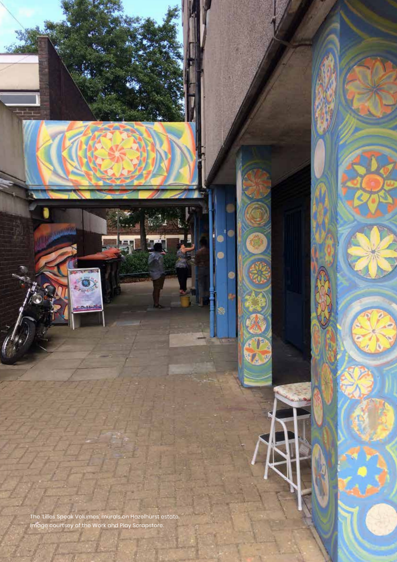
The 'Lilies Speak Volumes' murals on Hazelhurst estate.