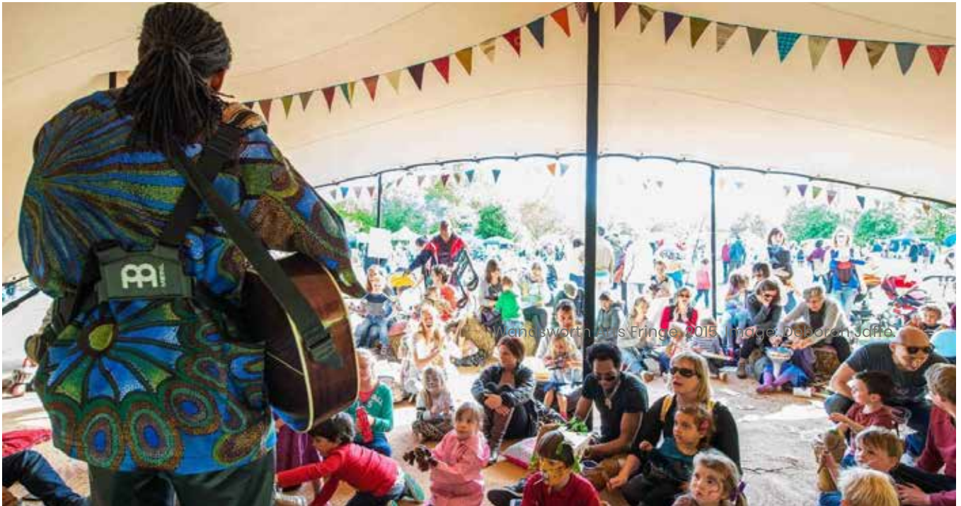
Wandsworth Arts Fringe 2019.