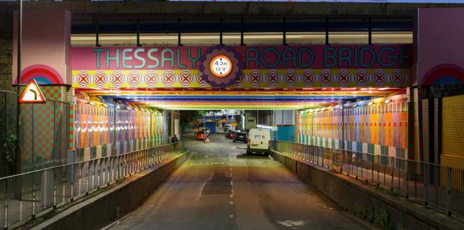
Top image: Yinka Ilori's 'Happy Street' designed to brighten up the dark underpass, used daily by residents, schoolchildren and commuters. Below image: World Heart Beat leading a procession through the underpass as part of the Happy Street Festival in 2019