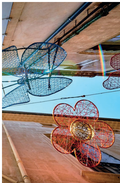
Festoon Light between lamps