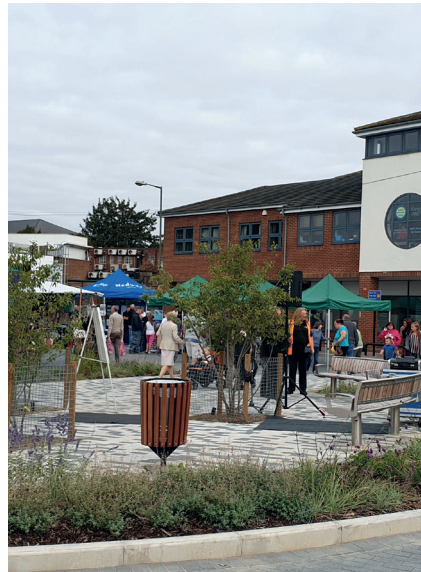
Pocket park with greenery