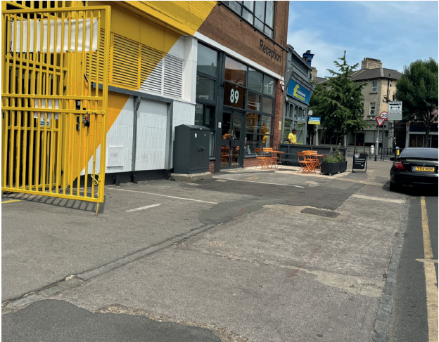
Bickersteth Road - No clear path outside Tooting Works - paving is broken