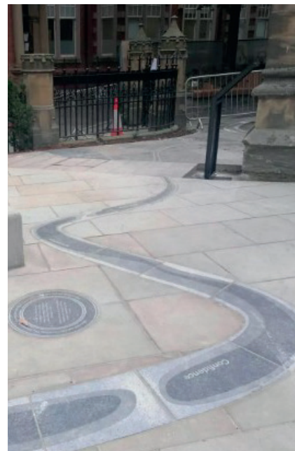
Curvy paving reflects the River Graveney that used to flow here