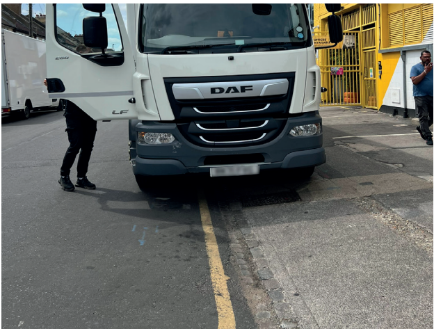
Bickersteth Road - Lorries damage the paving by parking over pedestrian space