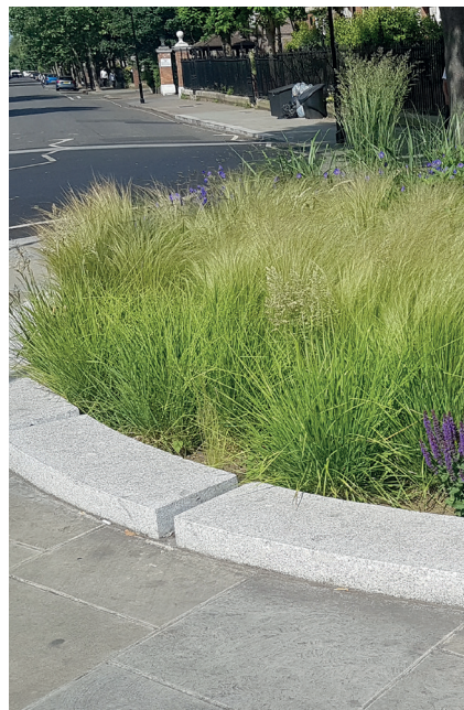
Rain Garden along edges