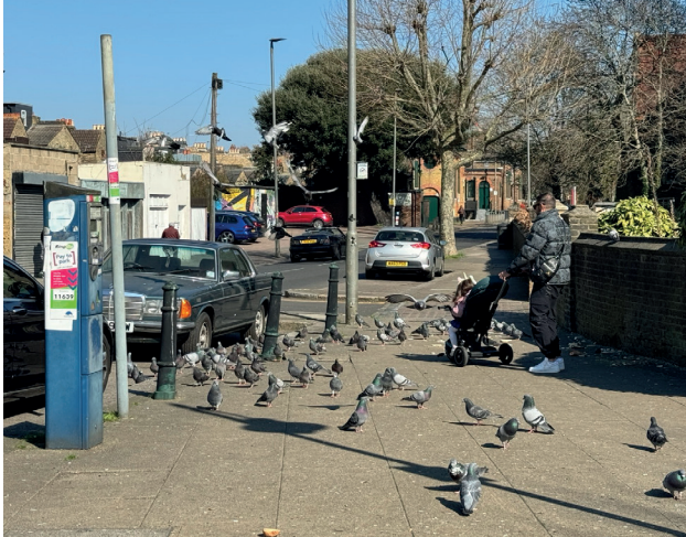
Church Lane corner - Leftover food attracts pigeons and makes the place less enjoyable