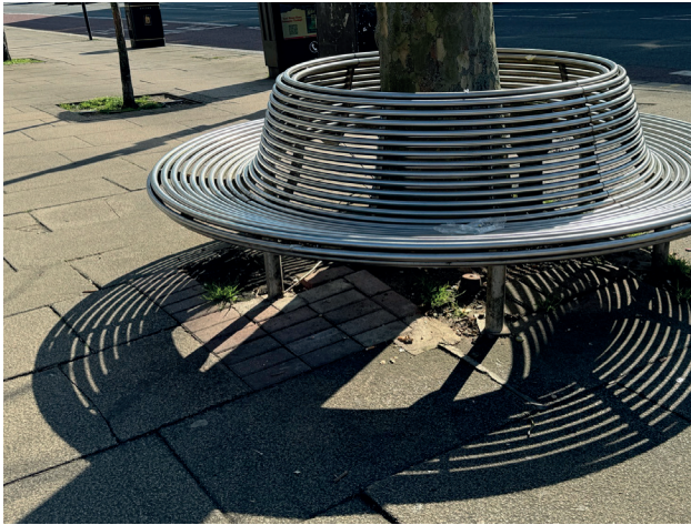
Church Lane corner - Damaged paving makes it harder to walk near the trees