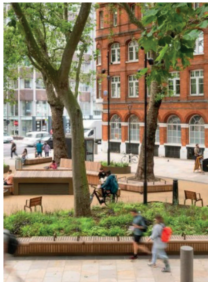
Planting bed with benches

The design upgrades Church Lane Corner and the Bickersteth Road entrance with high-quality paving that picks up a subtle river motif (a nod to the River Graveney that once ran here), more planting including sustainable rain gardens, pebble-style seats and timber benches, festoon lighting, and extra cycle parking.