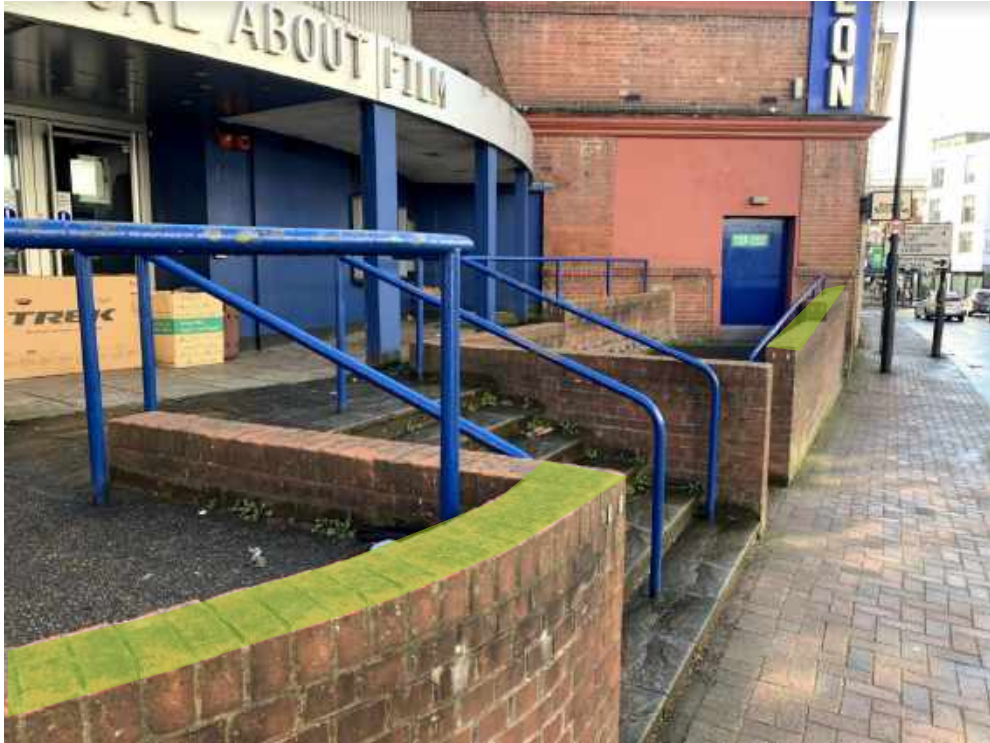
Location 5, Odeon - Proposed installation of wall planters with trailing planting to soften the look of the odeon.