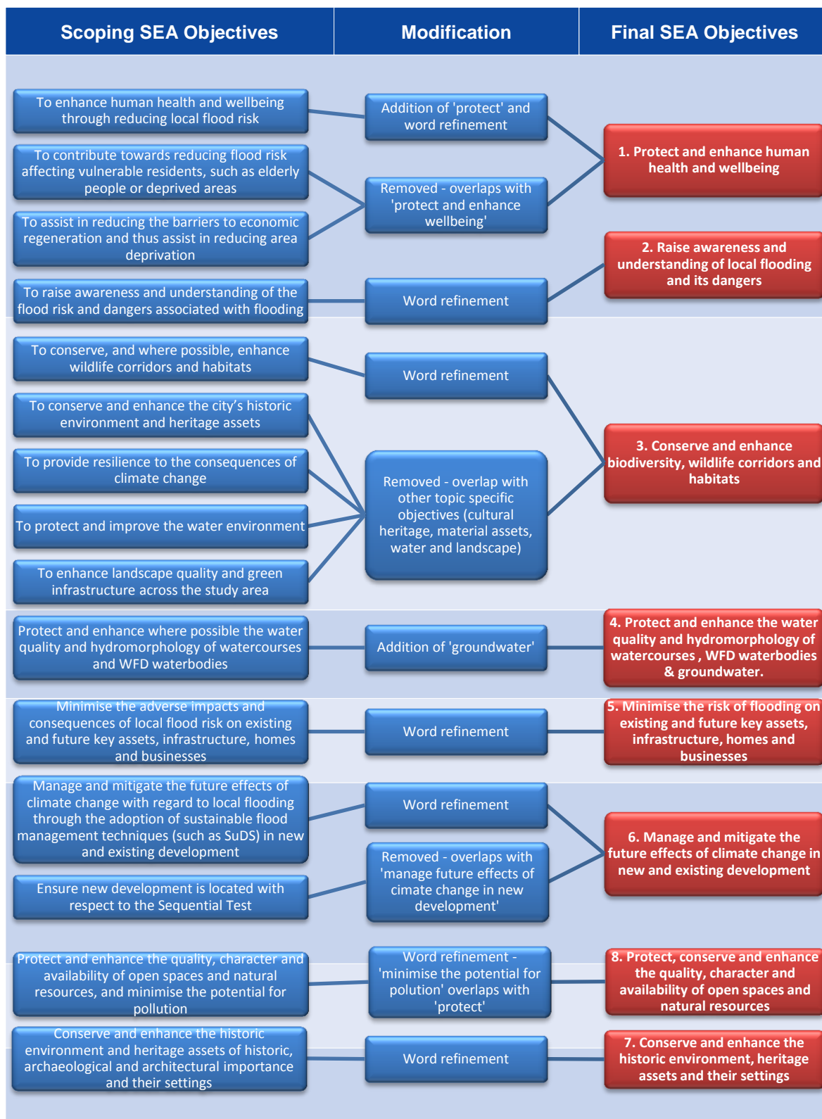
Figure 8.1: SEA Scoping objectives to final SEA objectives flow chart