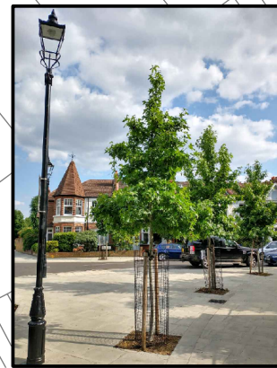
POINTED PAVING SLABS

ADDITIONAL SAFETY MEASURES OUTSIDE OF DEER PARK SCHOOL BEING ADDRESSED INDEPENDENTLY OF THIS SCHEME